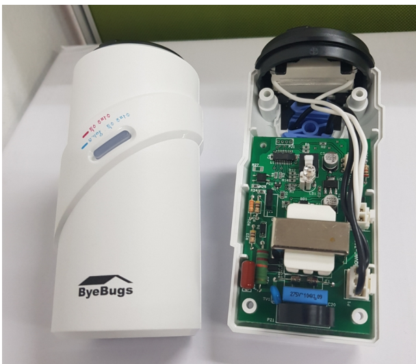
Figure 3: The PTC heater enables a novel and unobtrusive solution to bug control.

Figure 2 shows another application, where a larger PTCB heater is attached directly on a metal chassis to prevent condensation on components in an electronics cabinet exposed to outdoor temperatures. The power rating and positioning of the heater is optimised in relation to the thermal properties of the cabinet, to ensure the circuit boards remain dry without becoming overheated.