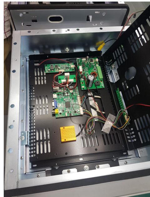
Figure 2: A PTCB Heater protecting electronic components against condensation.

Note also that the type of enclosure material and the thickness can be engineered to influence the internal temperature. A thermal insulating layer could be inserted between the heater and its mounting against the enclosure wall, to minimise heat loss. In other applications a heat spreader may be used to distribute heat throughout an enclosure; the properties of any thermal interface material (TIM) between the heater and heat spreader could be adjusted to fine-tune the temperature at a desired location. Riedon PTCA and PTCB heaters are designed with a large flat surface that assists attachment of a heatsink if required.