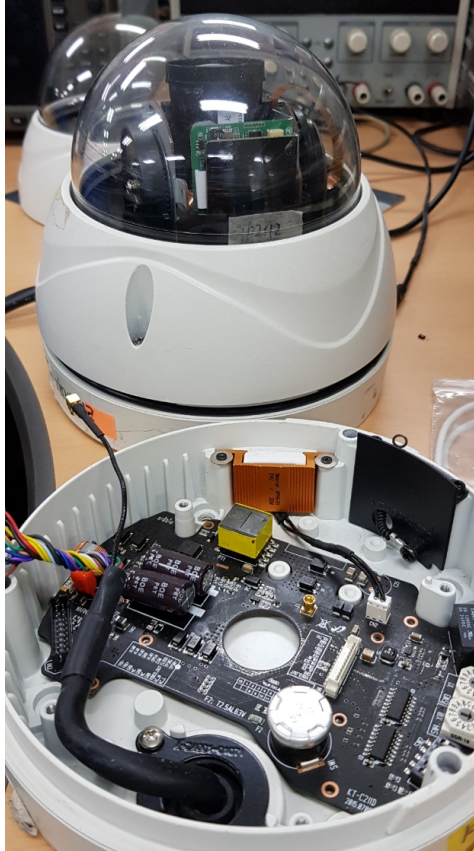
Figure 1: . The PTCA heater prevents condensation forming on the camera lens.

Although the heater is required to warm the internal space, a proportion will escape through the walls to the outside. This heat flow is quantified in a basic thermodynamic equation: